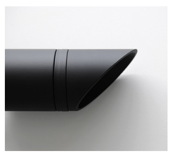
GG - GLARE GUARD 70mm x 63.5mm diameter