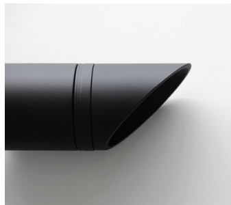
GG - GLARE GUARD

100mm x 63.5mm diameter (Black, white, silver only)