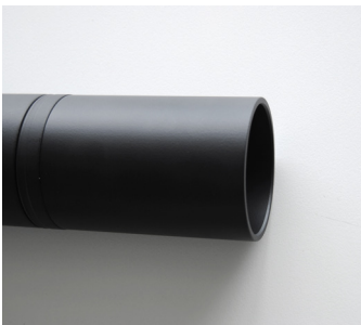
GGML - GLARE GUARD MOONLIGHT OPTION

100mm x 63.5mm diameter (Black, white, silver only)